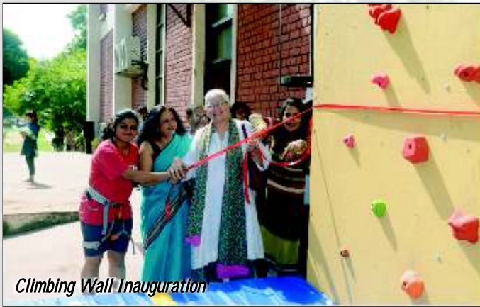
Climbing Wall Inauguration