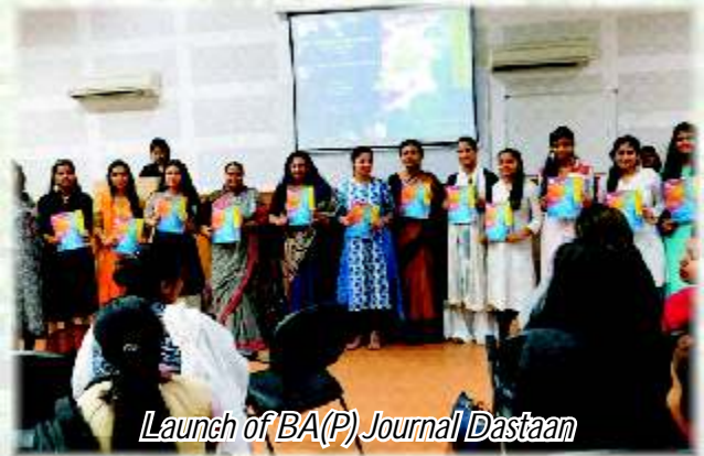
Launch of BA(P) Journal Dastaan