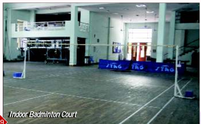
Indoor Badminton Court