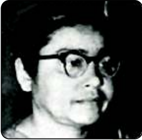
Sucheta Kriplani Freedom Fighter First Lady Chief Minister

The Indraprastha College Alumnae Association organizes and coordinates the alumnae activities. The College hosts an annual alumnae get-together on the second Saturday of February every year. The Executive Committee of the Alumnae Association works through the year to facilitate the strengthening of bonds between past and present students of the College. The College also has an Alumnae Portal to maintain the alumnae data base. The alumnae registration form are available on all the departmental portals and the students are encouraged to register after graduating.