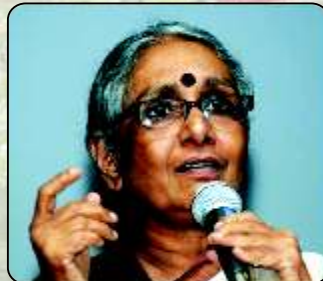
Aruna Roy RTI Activist