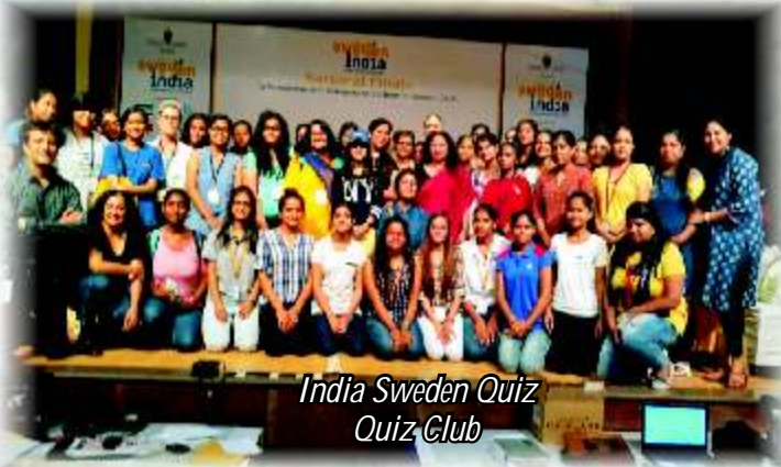
India Sweden Quiz Quiz Club