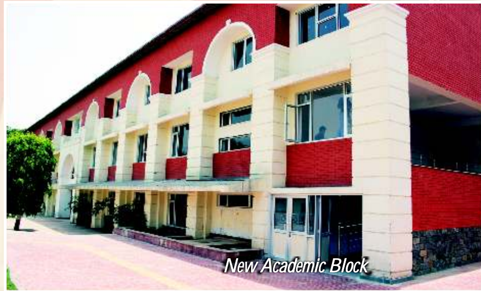
New Academic Block