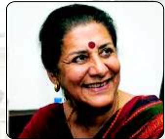
Ambika Soni Politician