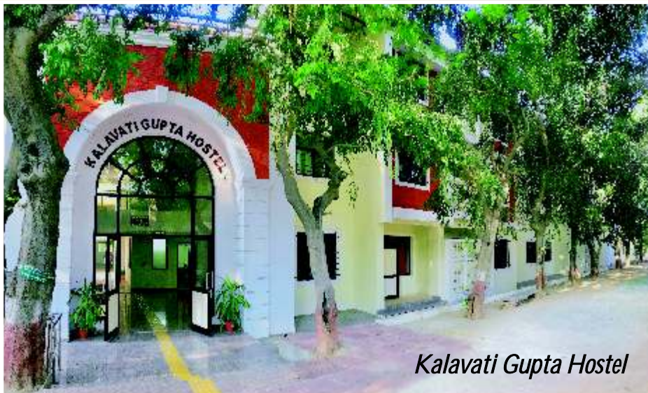
Kalavati Gupta Hostel