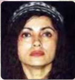
Deepa Sahi Actor