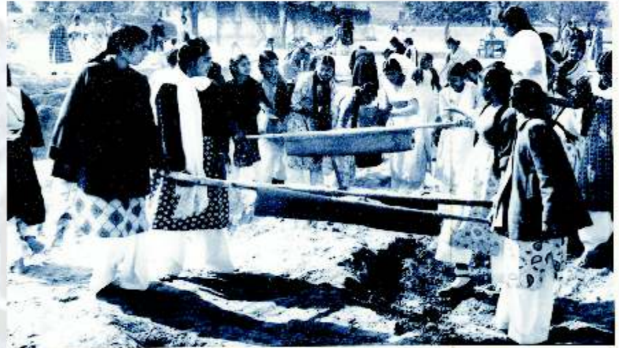
Students performing Shramdan at the digging of the Swimming Pool, 1955

1955 Initiative of digging the Swimming Pool