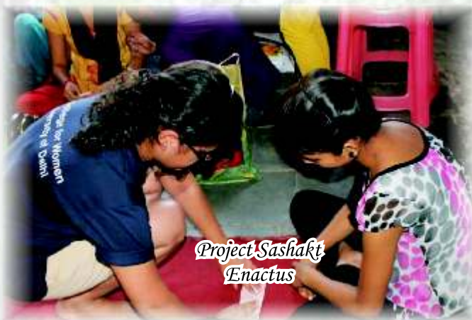
Project Sashakt Enactus