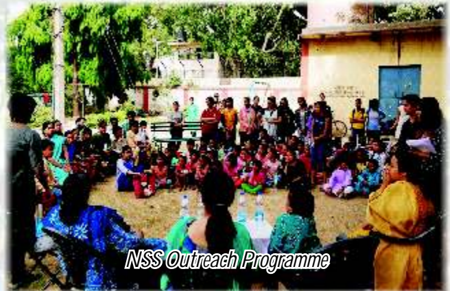
NSS Outreach Programme