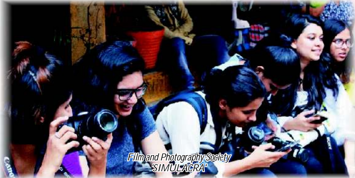
Film and Photography Society 'SIMULACRA'