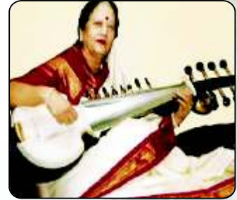
Sharan Rani Backliwal Sarod Player Recipient of Padma Shree & Padmabhushan