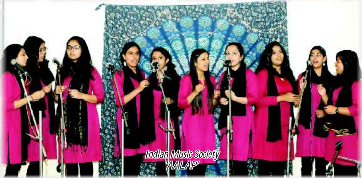
Indian Music Society 'AALAP'