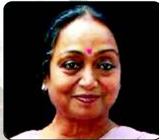
Meira Kumar Politician