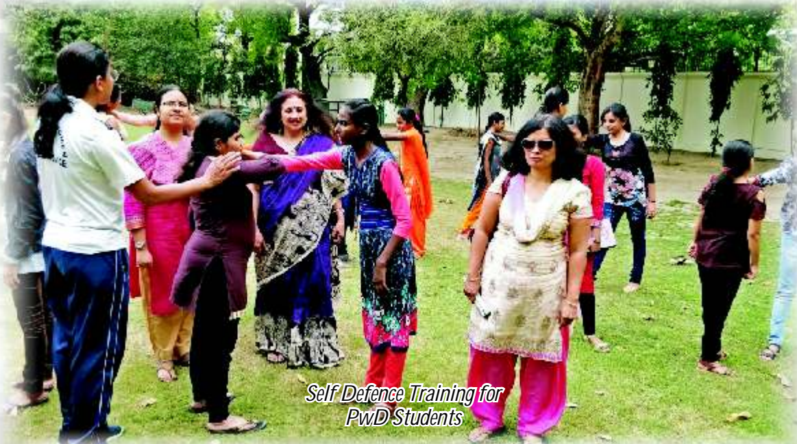
Self Defence Training for PwD Students