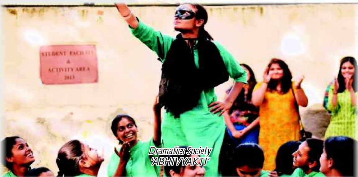
Dramatics Society 'ABHIVYAKTI'