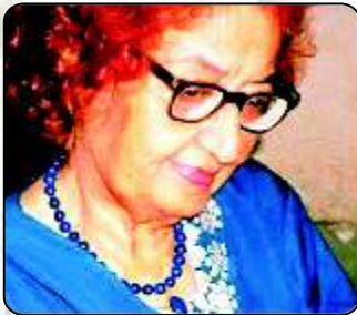
Qurratulain Hyder Writer