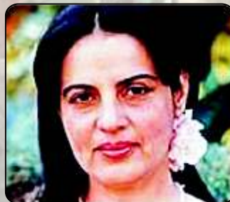
Salma Sultan Media